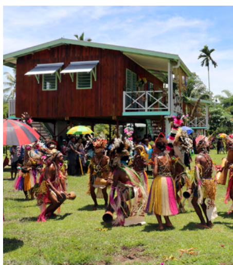
Students and the Kokoda community celebrate the launch of eight new education buildings funded through the Kokoda Initiative in 2017