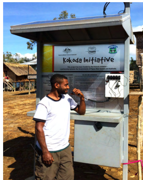
A solar radio panel kit at Kagi village, Mt Koiari

An upgrade and expansion of the VHF radio network was completed in 2016 at a cost of K673,000. This included 21 new radio handsets to improve access to communication, and installing USB points and solar panels to allow charging of small electronic devices in villages.