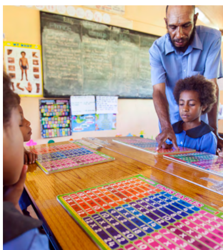
Students at Depo Elementary School in Sogeri, Central Province, in their new double classroom, funded through the Hiri District Administration and Kokoda Initiative in 2015