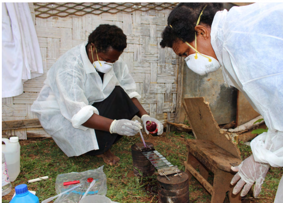
VHVs testing sputum for TB bacteria during an integrated health patrol in Naunumu village in Sogeri, Central Province in 2015.