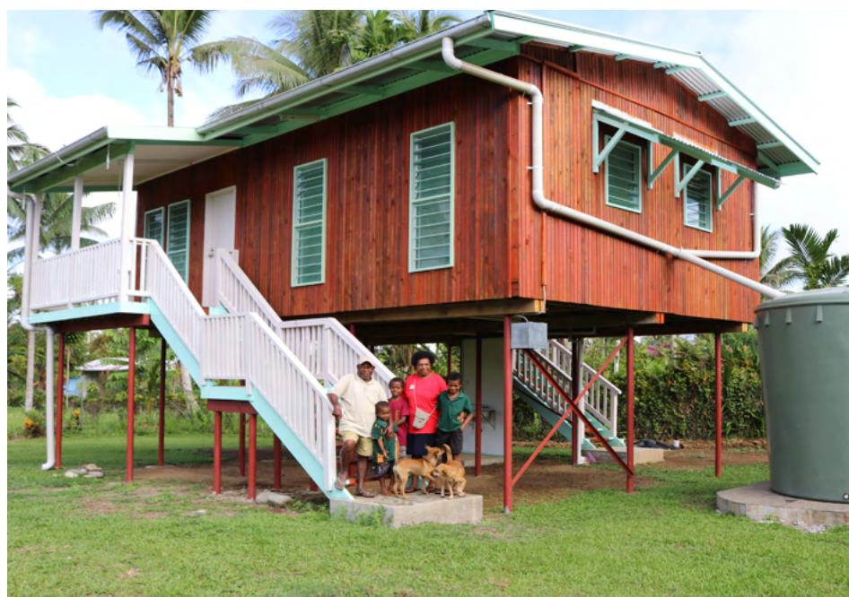
New health staff house at Kokoda Memorial Hospital, Oro Province. The new staff house was officially opened in November 2017 during Kokoda Day celebrations.

Below: KI supports training of VHVs and also provides them with basic health kits to help them with their voluntary health work in their communities