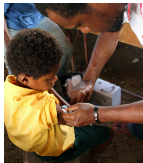
Above: A child is immunised at Kanga Elementary School in Oro Province

During the shortage of drugs across PNG in 2017, the Kokoda Initiative invested K185,000 to buy and distribute six months' supply of the top 30 essential drugs to all health facilities within the Kokoda Track.